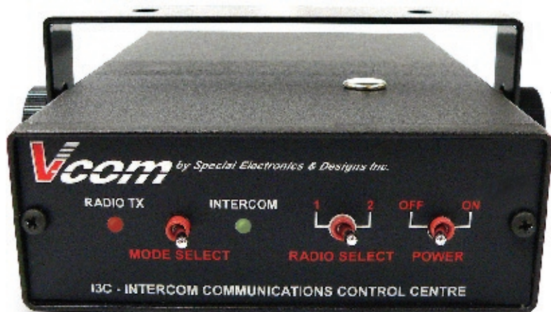
Control Centre and Select Switch photographs at actual size.